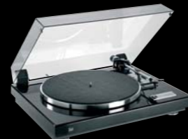
Piano laquer silver finish

Dimensions/Weight: 440 x 119 x 360 mm / 7.8 kg