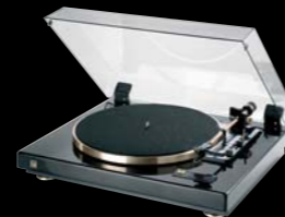
Piano laquer gold finish